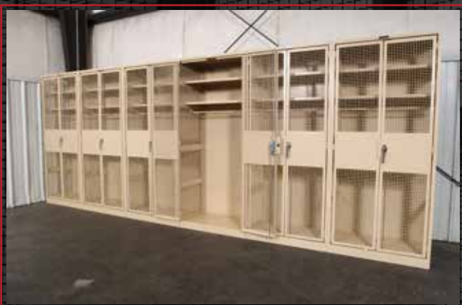
TACTICAL GEAR STORAGE