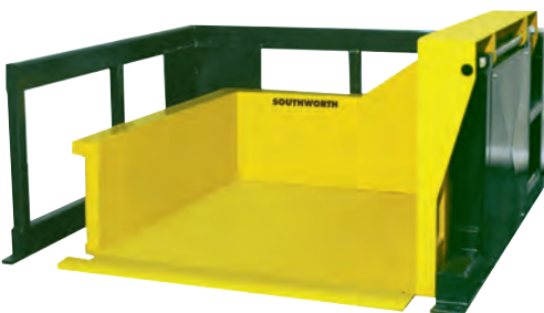
Optional Side Loading Configuration

Available in standard front loading configuration or optional side loading style for space restricted areas.