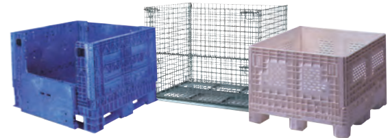
There is an E-Z Reach Tilter for every type of container