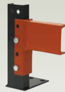
Bolted Connection Vertically adjustable on 2" centers