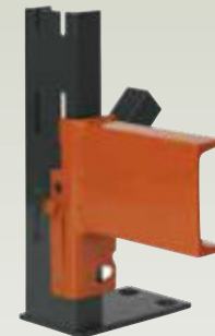
Slotted Connection Vertically adjustable on 4" centers