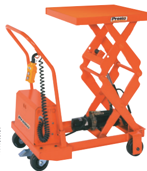
DBP Series Portable Double Scissor Lift