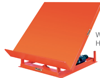
Wide Base Fixed Height Tilter