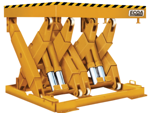
MLTDL Double-Long Series