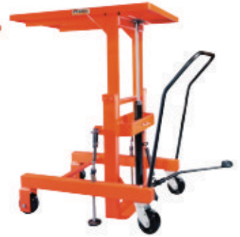
Hydraulic Cantilever Lift