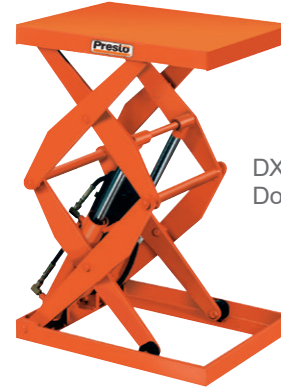
DXS Series Double Scissor Lifts