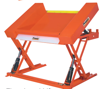
Floor Level Lift & Tilt Table