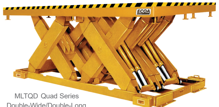
MLTQD Quad Series Double-Wide/Double-Long