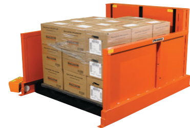
P4™ Roll-On Pallet Positioner