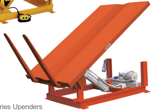
UT90 Series Upenders