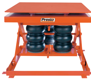
Pneumatic Scissor Lift & Rotate