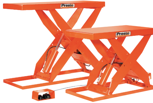
XL Series Standard Duty Scissor Lifts

Presto ECOALifts offers a full line of Hydraulic Scissor Lift Tables with capacities up to 12,000 lbs., available in: Light Duty; Standard Duty; Heavy Duty; and Compact, Double High configurations. They position material at just the right level to eliminate bending, stretching, and reaching.