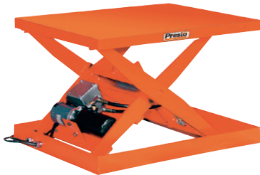
XS Series Light Duty Scissor Lifts