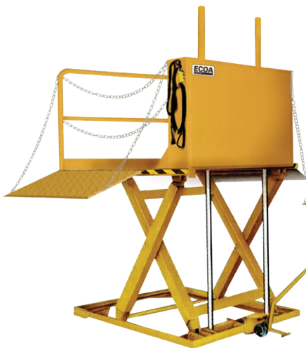
Trans-A-Dock TAD Series Surface Mount Loading Dock Lifts