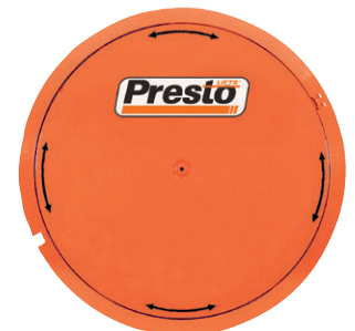
Low Profile Turntable