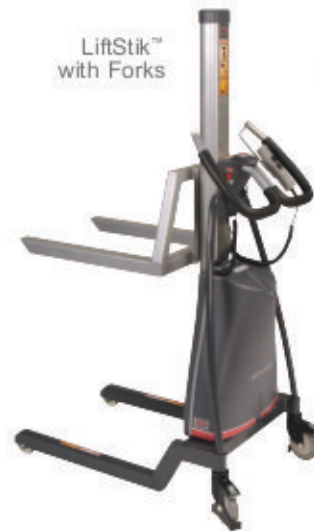
LiftStik™ with Forks