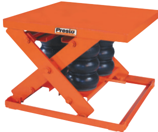
Pneumatic Scissor Lift