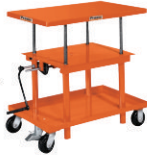
Mechanical Post Lift

Post lift tables are available in a variety of configurations including two-post, four-post, and cantilever. Choose 1,000, 2,000, or 3,000 lb. capacity units with platform sizes from 20" x 30" up to 30" x 60". Lifting and lowering options include mechanical hand crank, foot pump actuated and electrohydraulic.