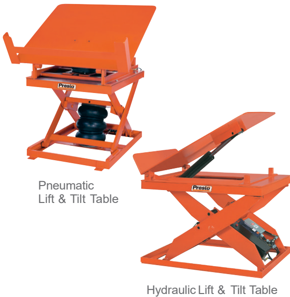
Pneumatic Lift & Tilt Table