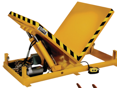
HUE Series Upenders

UT90 Series Upenders are available with platens or forks as well as optional v-cradle platforms.