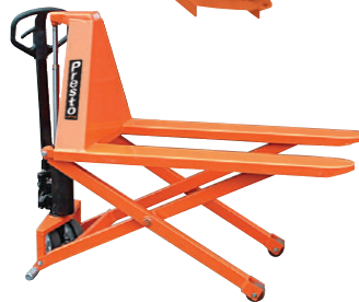
Manual Skid Lifter