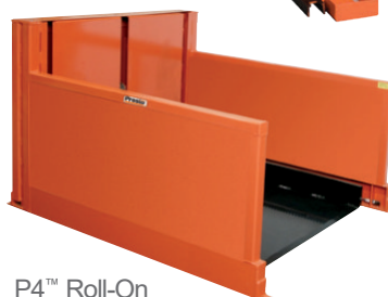
P4™ Roll-On Pallet Positioner