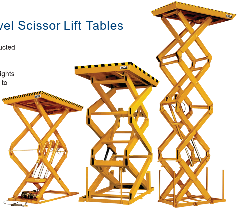
DSL Series Double Scissor Lift Tables

These high-travel double, triple, and quad scissor lift tables are designed and constructed for heavy-duty applications that require extended vertical travel. Multiple scissor mechanisms allow for maximum lifting heights in a small footprint. Capacities from 2,000 to 6,000 lbs. are available with lift heights from 70" up to 356".