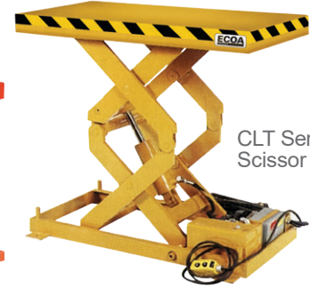
CLT Series Double Scissor Lifts