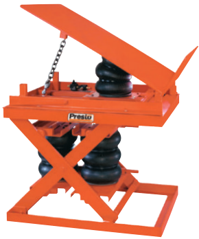
Pneumatic Scissor Lift & Tilt