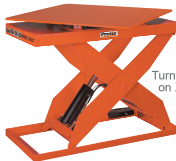
Turntable Mounted on XL Series Lift

Standard turntables can be mounted to the floor, to a fixed height stand, or to a lift table.