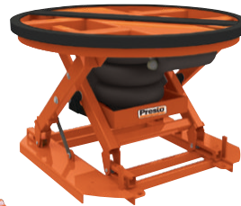
P3™ All-Around Pneumatic Load Leveler