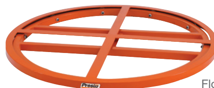
Floor Mount Turntable Ring