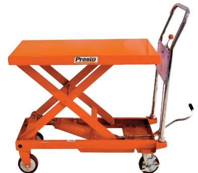
XP Series Portable Manual Scissor Lift