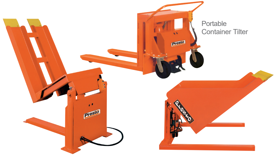
Stationary Container Tilter

Floor Level units work with any style of container and can also be fed by a hand pallet truck.