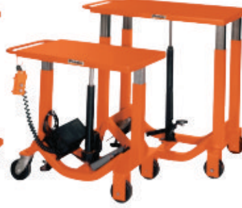
Hydraulic Post Lift