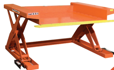
Floor Level Lift