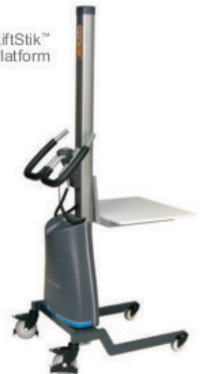
LiftStik™ With Platform