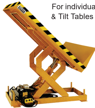
CLTLT Series SpaceSaver Lift & Tilt Tables

Fixed Height Tilters are also available and can be mounted on legs, work benches, or directly to the floor.