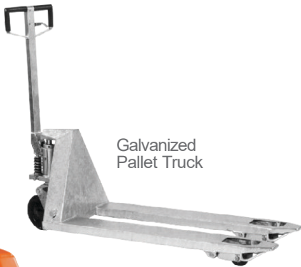
Galvanized Pallet Truck