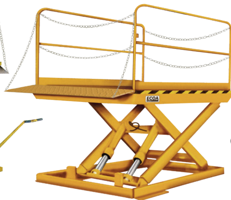
SizzrDok HLD Series Dock Lifts