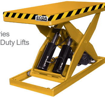
HH Series Heavy-Duty Lifts