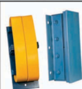
IMPACT™ SERIES DOCK BUMPERS