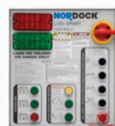
LOGI-SMART™ INTEGRATED CONTROL PANEL