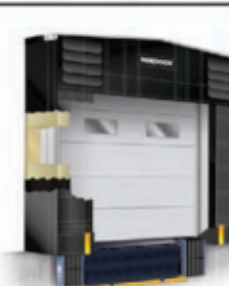
WEARTOUGH® DOCK SEALS & SHELTERS