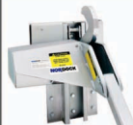
SMART-HOOK® & TRUCK-LOCK® VEHICLE RESTRAINTS

Longer models & special sizes available to suit existing pits.