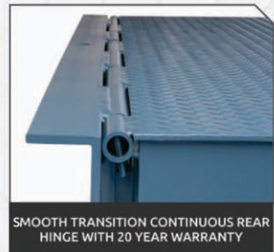
SMOOTH TRANSITION CONTINUOUS REAR HINGE WITH 20 YEAR WARRANTY