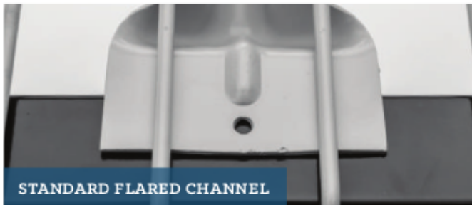
STANDARD FLARED CHANNEL