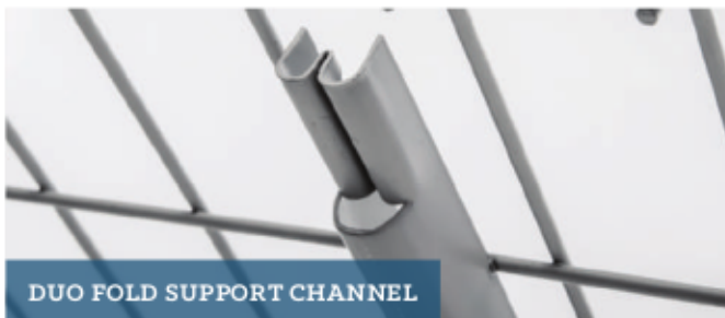
DUO FOLD SUPPORT CHANNEL