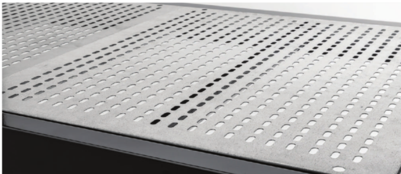
VIEW FROM BELOW