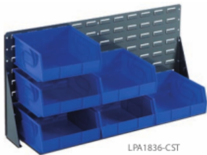
LPA1836-CST shown with PB1011-5

Organize your workbench with LEWISBins+ easy-to-assemble Bench Assemblies. Durable Louvered Panels are accompanied by 16-gauge steel legs that can be added with fasteners. Pre-configured systems with bins are available or bins can be ordered separately. Louvered Panel Bench Assemblies hold 100-130 lbs.