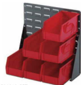
LPA1818-CST Shown with PB105-5