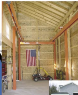
Home Owner Interior & Exterior