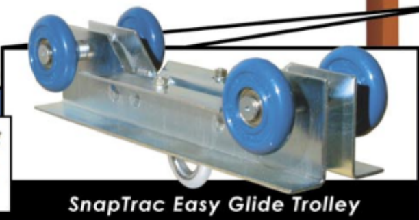
SnapTrac Easy Glide Trolley