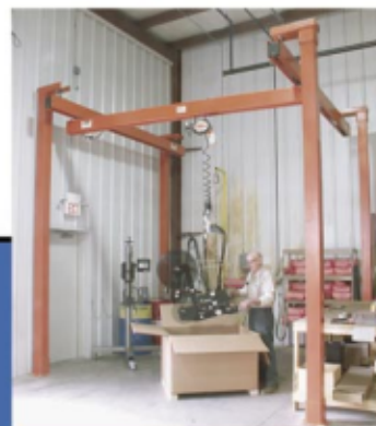
CTM Integration Inc.