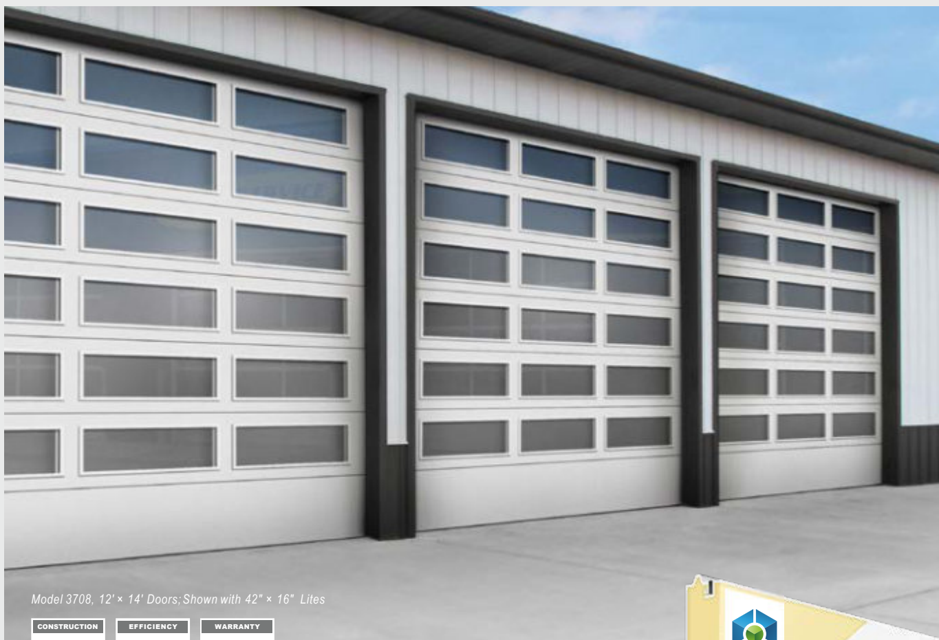
Model 3708, 12' x 14' Doors; Shown with 42" x 16" Lites